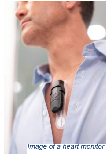
Image of a heart monitor

If you are 65 years or older at the time of your visit, we may also ask if you would be prepared to wear a heart monitor for 14 days. This is a water-resistant monitor secured with an adhesive patch that is applied to your skin over the heart, which will provide information on heart rhythm. We will give this to you when you visit us, together with a box so that you can return the device to us after the 14-day period.