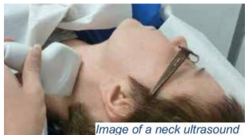
Image of a neck ultrasound

This uses ultrasound (high-frequency sound waves) to produce images of the blood vessels on either side of the neck. These images will help scientists study any narrowing of these major blood vessels. The neck ultrasound scan takes about 10 minutes.